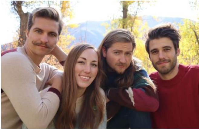
Birdwatchers Ukelele Group

The world famous Birdwatchers Ukelele group are at the end of their Florida tour and will be giving Arbor Trace a sneak preview on April 11 th at 4p.m. at the Top of the Pointe for their Veterans' benefit Concert on Sunday, April 14 at the Ballroom on St John the Evangelist Church's campus. Arbor Trace will be given an allotment of half-price tickets for the benefit concert on Sunday, April 14.