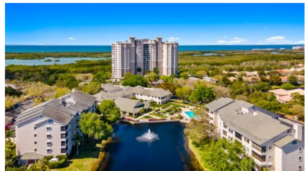
Arbor Trace Realty

A 501©(3) Charity benefiting the employees here at Arbor Trace in the event of hardships and scholarships